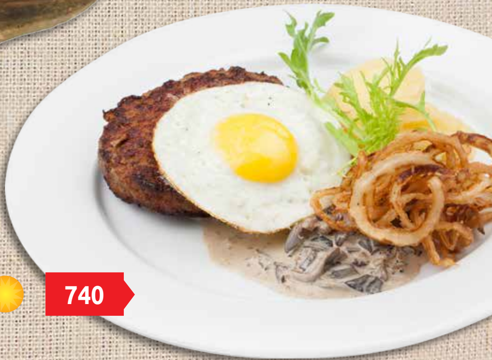
VEAL BEEFSTEAK (1/200/100/50/40/30) ..... 740 (served with mashed potatoes, mushroom sauce, fried onion and fried egg)