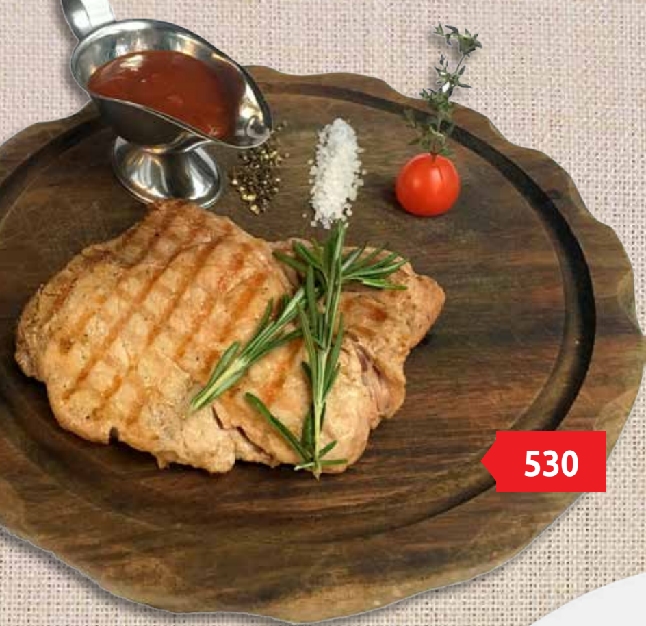
PORK NECK STEAK (1/220/70/20)..... 530 (served with BBQ sauce and cherry tomato, crushed black pepper and sea salt)